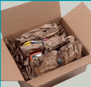
WRAP AND LAYER