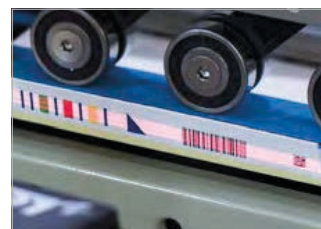
Barcode Reader (1D & Pharmacode)