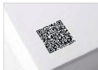
2D Code Reading