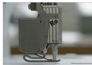
Cold Glue Application

In addition, sensors for hot melt and cold glue not only detect the glue but also the thickness of the glue bead. Therefore, it guarantees the presence of glue and that there is the right quantity to securely seal the packaging.