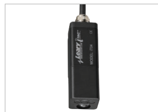
Sensor for Cold Glue Detection