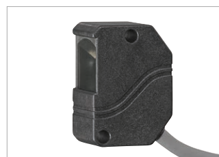
Sensor for Hot Melt Detection